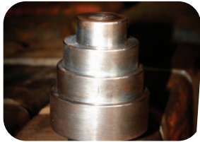
Automotive Engine Components