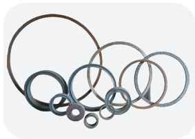
Oil & Gas Valve Bodies and Pipeline Fittings