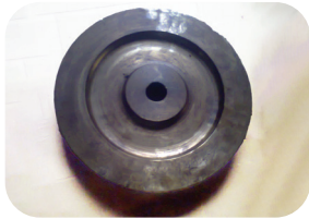
Railway Forged railway wheels