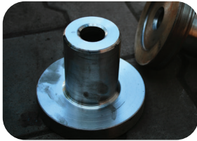
Aerospace Shafts and Bearings