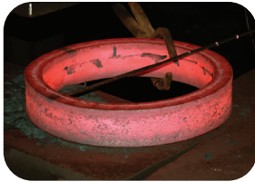
Energy Generator Shafts